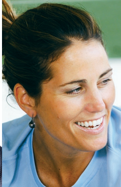
JULIE FOU DY